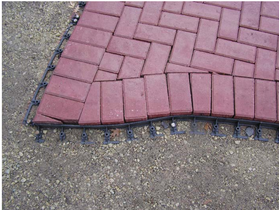
Figure 4—A photo of the Snap Edge curved section after final compaction. Note the large outward deflection. Deflection of this magnitude was common for measurements exceeding 0.200.”