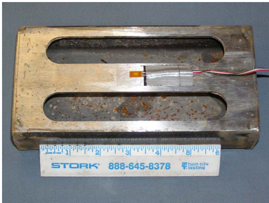
Figure 2--One of the test pavers used to measure the outward force on the edging.