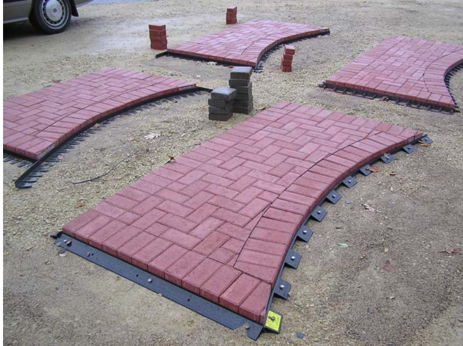
Figure 1--The test areas.