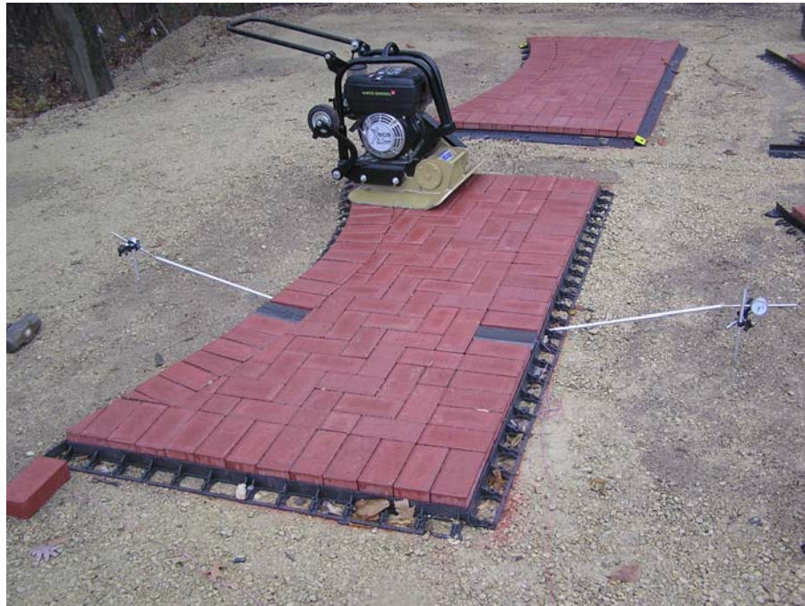
Figure 3--Test and instrumentation setup.